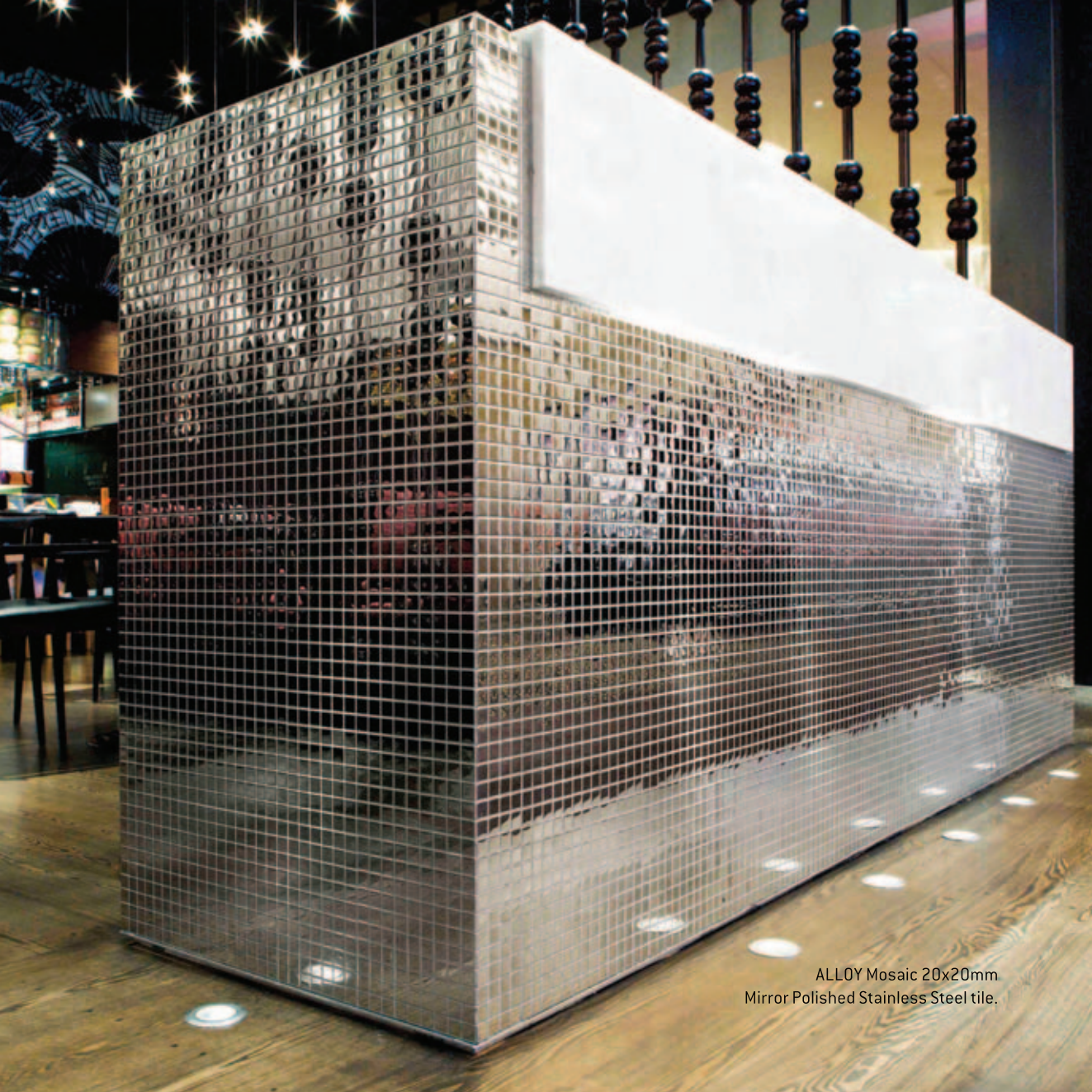
ALLOY Mosaic 20x20mm Mirror Polished Stainless Steel tile.