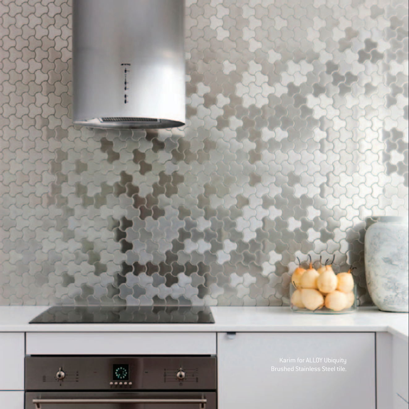
Karim for ALLOY Ubiquity Brushed Stainless Steel tile.