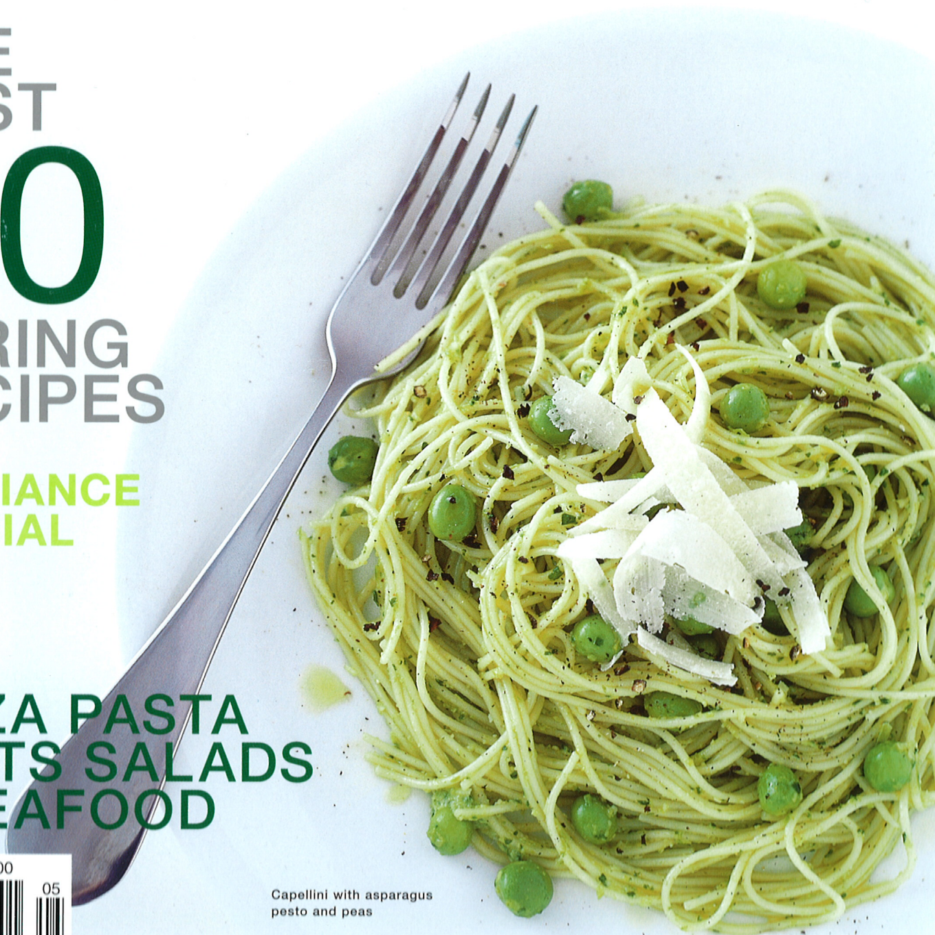
Capellini with asparagus pesto and peas