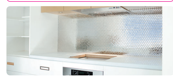
Installed: ALLOY Dollar tile in mirror polished stainless steel

See overleaf for the available finishing pieces.